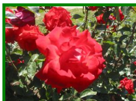
„ Foc de Tabără "