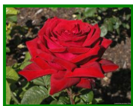
„ Burgund "

For the four varieties of roses studies we drew up quality evaluation sheets that comprise the reliability characteristics and the data regarding which we made the observations (tables 1 - 6).