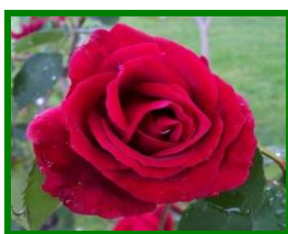
„ Crymson Glory "