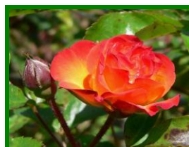
„ Rumba "